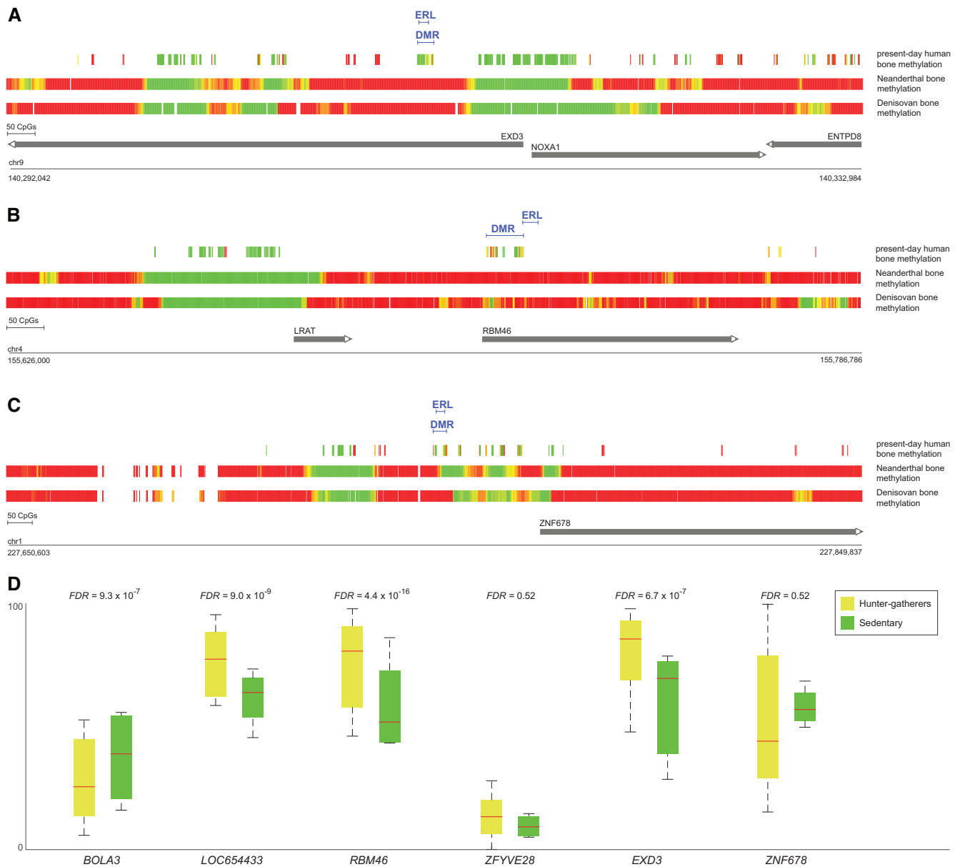
Fig. 2. Methylation patterns in the Neanderthal and the Denisovan point to a low-calorie diet. Methylation maps are shown for a present-day human, a Neanderthal, and a Denisovan. Each line represents a CpG position. Methylation levels are color-coded from green (unmethylated) to red (methylated). Present-day human maps are partial because the protocol used to produce the maps was reduced representation bisulfite sequencing (RRBS), which provides information for \sim 10\% of CpG positions. Reconstructed ancient methylation and DMRs were taken from (Gokhman et al. 2014). ERLs were taken from Dominguez-Salas et al. (2014). (a) Archaic humans are hypermethylated in the EXD3 gene compared with the present-day human. The DMR completely overlaps the ERL, where hypermethylation is associated with low-calorie diet. (b) The Neanderthal is hypermethylated in the RBM46 gene compared with the present-day human. The DMR partially overlaps with the ERL, where hypermethylation is associated with low-calorie diet. (c) The Denisovan is hypermethylated upstream of the ZNF678 gene compared with the present-day human. The DMR completely overlaps the ERL, where hypermethylation is associated with low-calorie diet. (d) Box plots of methylation levels of hunter-gatherers and sedentary individuals within the six hunger-related ERLs. In LOC654433 , RBM46 , and EXD3 hunter-gatherers are significantly hypermethylated compared with sedentary individuals, reflecting possible low caloric intake. Within BOLA3 , however, hunter-gatherers are hypomethylated.

(Dominguez-Salas et al. 2014). Particularly, we found that LOC654433 , RBM46 , and EXD3 are significantly hypermethylated in hunter-gatherers compared with sedentary individuals, compatible with their hypermethylation in Gambian individuals conceived during the hungry season, whereas BOLA3 presents the opposite trend, incompatible with hunter state (fig. 2d).